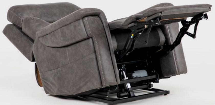
Zero gravity function

The Alivio Lift Recliner Range blends modern aesthetics with a range of ultra-durable fabrics - designed to suit any home.